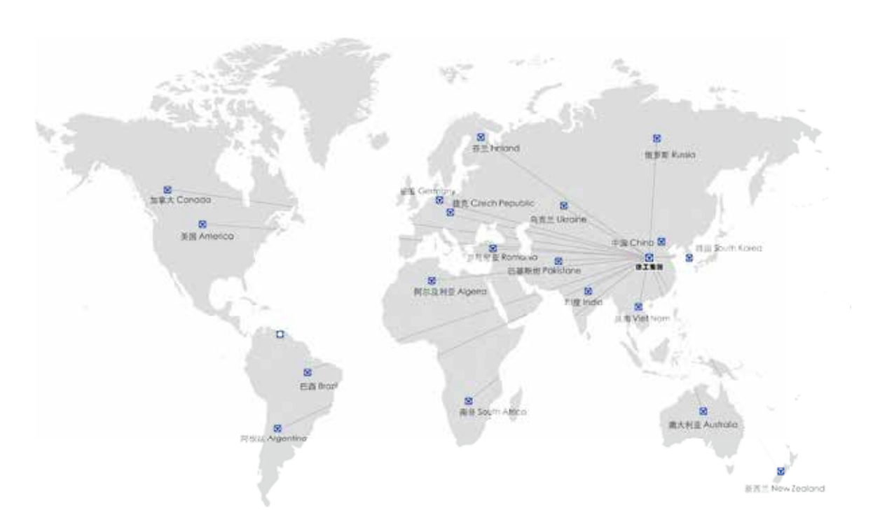
XCMG FOR YOUR SUCCESS